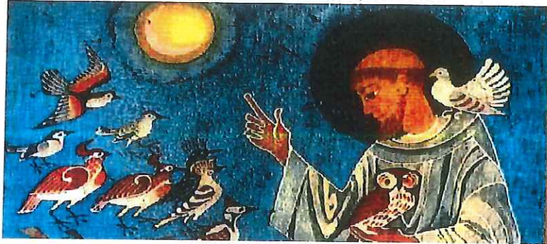
The Canticle of the Creatures by St. Francis of Assisi

* Wk. 1 – What’s an “Awe Walk”? It is an intentional way of walking/meditating ... “a walk within a place of meaning and beauty, where your sole (soul!) task is to encounter something that amazes and transcends, be it big or small.” https://ggia.berkeley.edu/practice/awe_walk