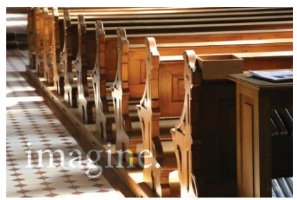
Helping Our Parish Grow WEEKLY OFFERTORY

The Bulletin had to be transmitted early due to Easter. The offertory collection will be in next weekend's bulletin.