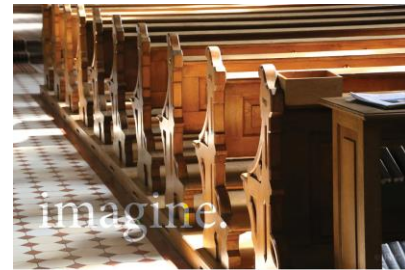
Helping Our Parish Grow WEEKLY OFFERTORY

MONEY The Bulletin had to be transmitted early. The offertory collection will be in next weekend's bulletin.