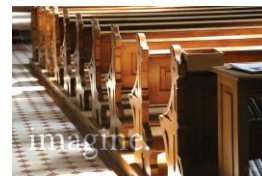
Helping Our Parish Grow WEEKLY OFFERTORY