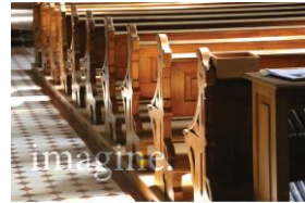
Helping Our Parish Grow WEEKLY OFFERTORY