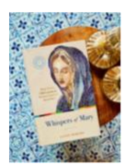
WOMEN'S BIBLE SHARING Summer Session Whispers of Mary

Call or visit the office and the parish staff will help you through the process. Office hours are 8-4pm Monday through Thursday. Or go to our web site, <a href="www.stpatricks-pelham.com">www.stpatricks-pelham.com</a>, at any time to set up an automatic donation plan. Please consider electronic giving. Thank you!