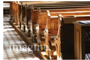
Helping Our Parish Grow WEEKLY OFFERTORY