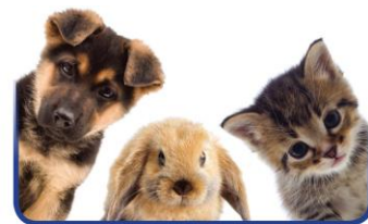
"Mom, Dad, Can you take us to church with you?"

The Right of Life Benefit Banquet is on November 3, 2022 at the Event Center in Nashua. If you register before September 22 nd , you will receive a discount. For more information or to register go to nhrtl.org/banquet2022 .