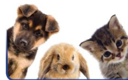
“Mom, Dad, Can you take us to church with you?”

Your contributions toward the support of the parish and its ministries are greatly appreciated.