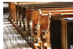
Helping Our Parish Grow WEEKLY OFFERTORY

Thank you for your faithful & generous support ~St. Patrick Parish~